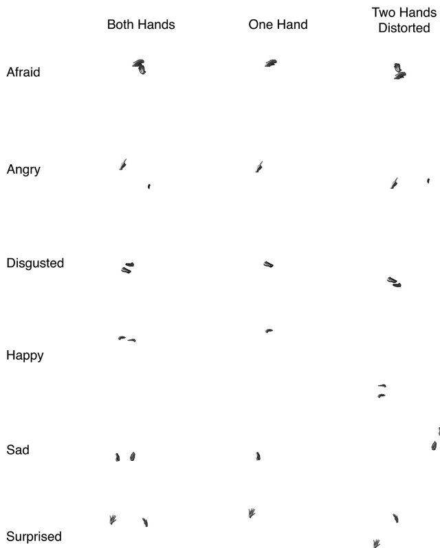
Figure 1 Examples of Stimuli From One Actor

six emotion labels was constant across trials for each participant, but two different orders were used across participants.